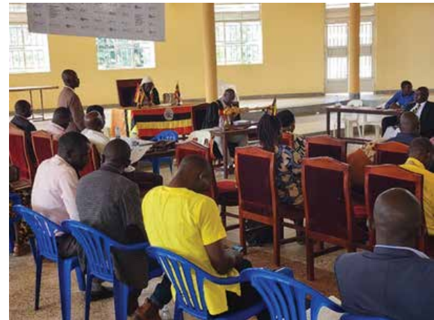
Certification of the child labour bye law Imanyiro by the district council