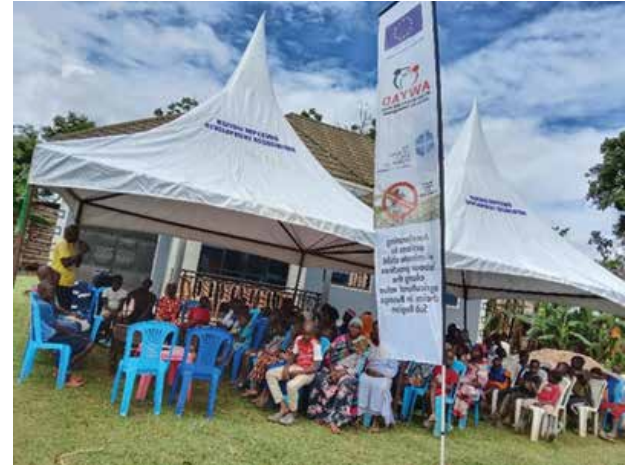
Children's community parliament at Bufulubi parish

“Ending child labour is not the responsibility of one institution alone; it is a shared commitment between families, communities, and leaders to put children first.”