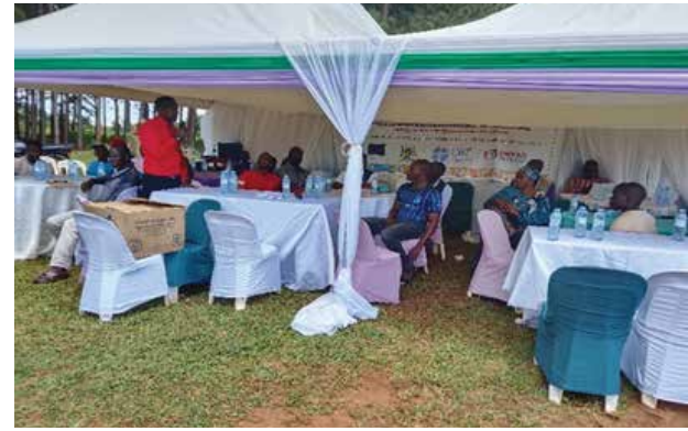
CAO officiating children's symposium women's celebration

AWYAD further distributed scholastic materials to 166 vulnerable learners , supported the ratification of the Imanyiro Child Labour By-law, engaged the business community to identify 26 child labour cases , and strengthened livelihoods through savings groups mobilising over UGX 5.27 million .