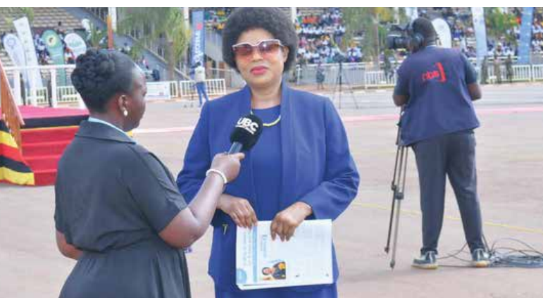
The UN Women country representative giving speech during the commemoration of IWD at Kololo

Community members also raised concerns related to loss of income, rising rent, unemployment and lack of documentation, calling for stronger collaboration with government institutions and partners.