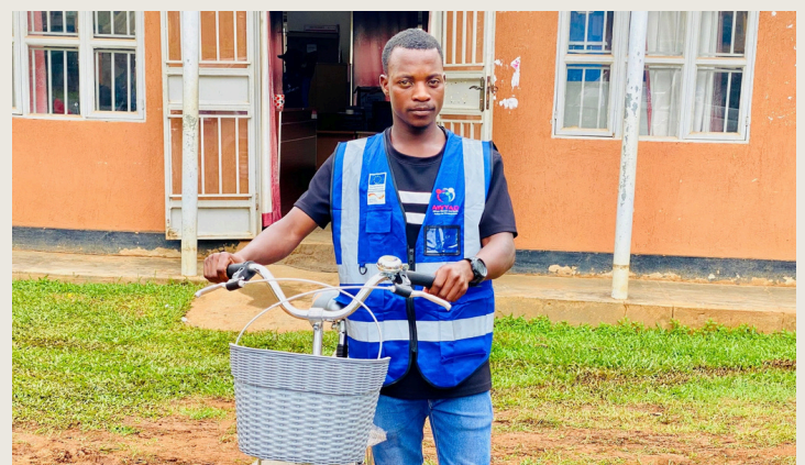
EXTENSION WORKERS RECEIVED BICYCLES

Participants appreciated the simple, practical breathing tools for managing anger, fear, and overwhelming thoughts.