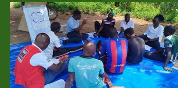
AWYAD staff explaining ways on how youth can break the inactivity cycle

These partnerships increased trust, alignment with district priorities, and long-term sustainability.